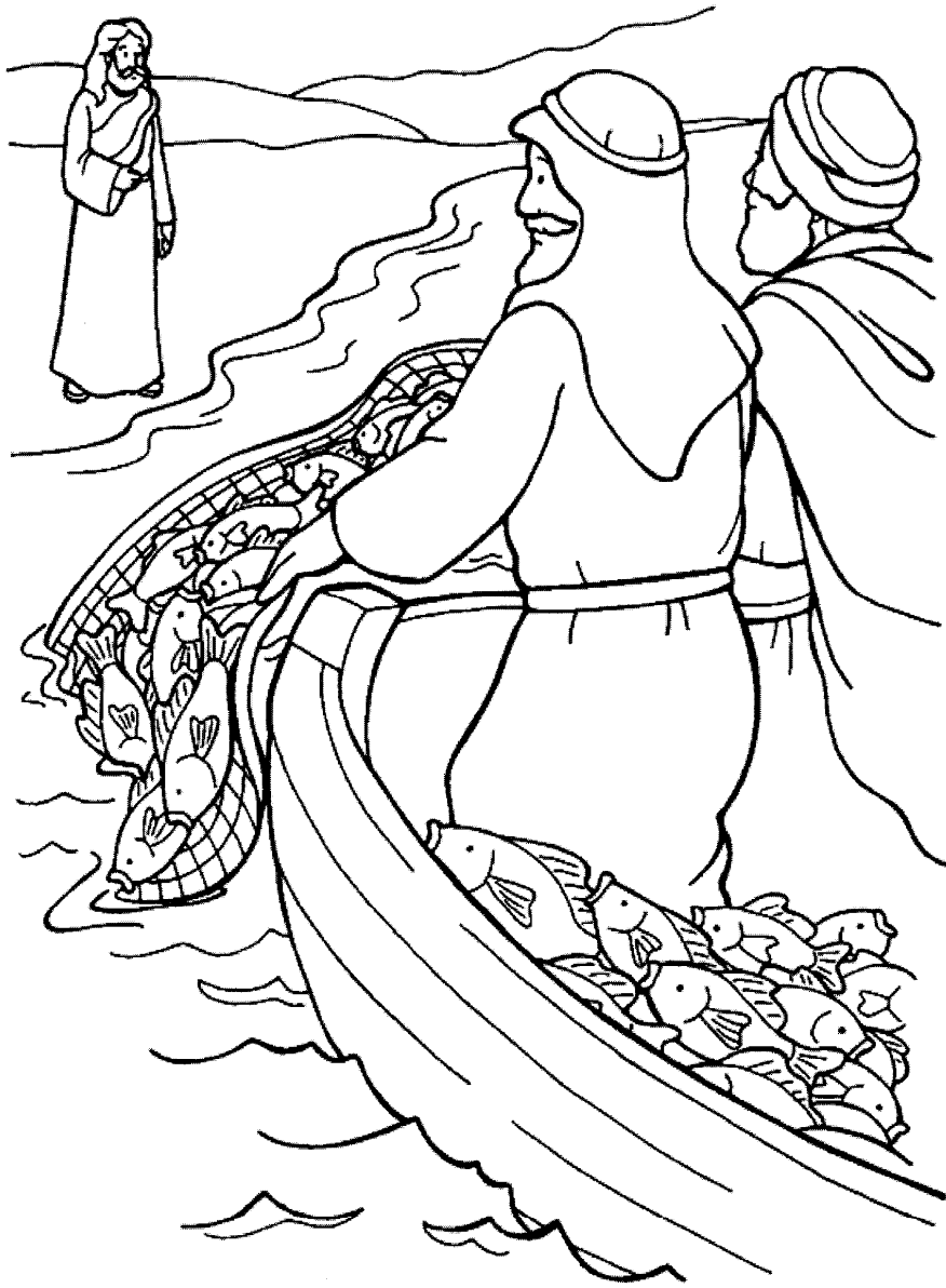
Jesus called out to them, "Come, be my disciples, and I will show you how to fish for people!" Matthew 4:19 (NLT)