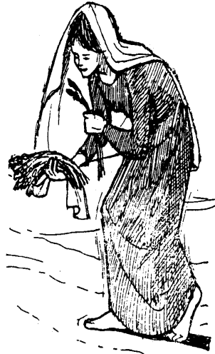
A poor widow

Jesus compared the teacher of the Law with a poor widow. Put (T) teacher and (W) widow against the things Jesus pointed out.